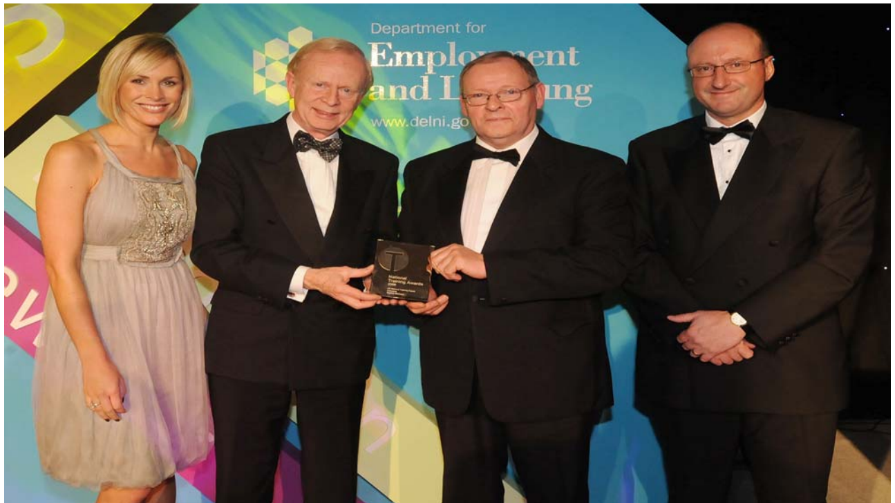
GMTV Presenter, Jenni Falconer is pictured alongside the Minister and one of the 2008 National Training Award Winners

The 2008 National Training Awards were hosted by TV presenter, Jenni Falconer. A total of 22 prizes were presented before 300 business leaders and representatives from the public sector. Five of these winners achieved National winner status and went on to represent Northern Ireland at the UK National ceremony in London.